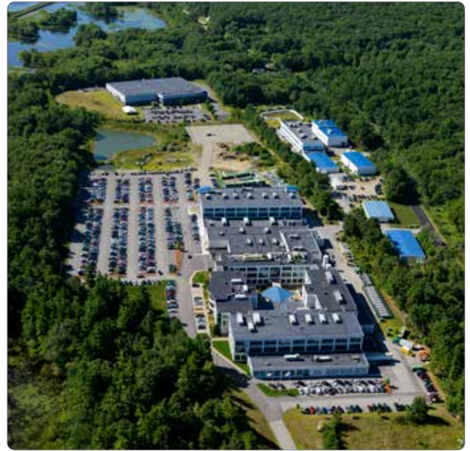
IPG Photonics World Headquarters, Oxford MA, USA

IPG Photonics is the world leader in high power fiber lasers and amplifiers. Founded in 1990, IPG pioneered the development and commercialization of optical fiber-based lasers for use in a wide range of venues such as materials processing, medical, scientific and other advanced applications. Fiber lasers have revolutionized the industry by delivering superior performance, reliability and usability at a lower cost of ownership compared with conventional lasers, allowing end users to increase productivity and decrease operating costs. IPG is headquartered in Oxford, MA with additional facilities throughout the world.