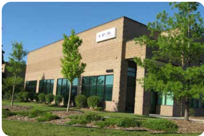
IPG Photonics Midwest Operations Novi, MI